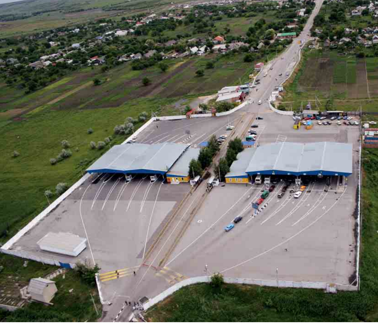
Kuchurhan international road border crossing point