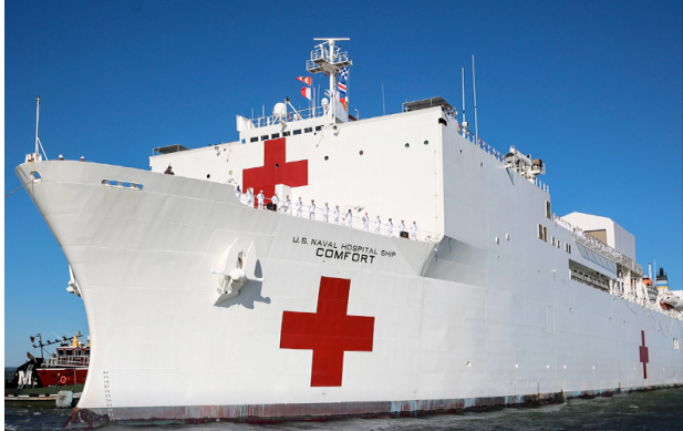
USNS Comfort (T-AH-20)