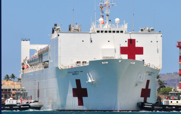
USNS Mercy (T-AH-19)