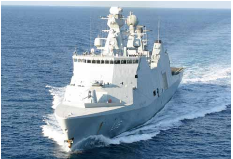
The Danish ship, Absalon.

lished a framework for the international efforts through UN Security Council Resolutions 1851 (2008), 1897 (2009),